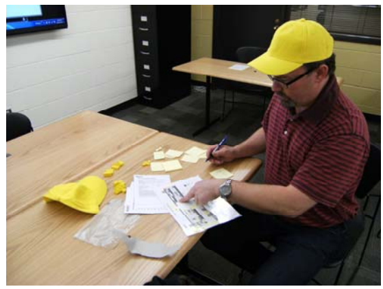
Figure 1: Preparation for round one