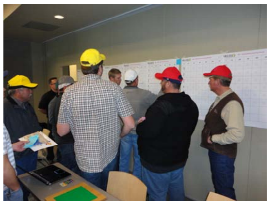
Figure 3: Collaborative pull-planning

Pull-planning in the Villego® simulation is accomplished in precisely the same manner as on real construction projects. Each subcontractor represents a different color (or trade) and provides input in to the sequence of the project. The sequence is represented by colored Post-it notes on a weekly calendar board. Starting at the end of the project, the final subcontractor promises to accomplish their work after agreeing on the terms of the hand-off with the subcontractor before him (the predecessor).