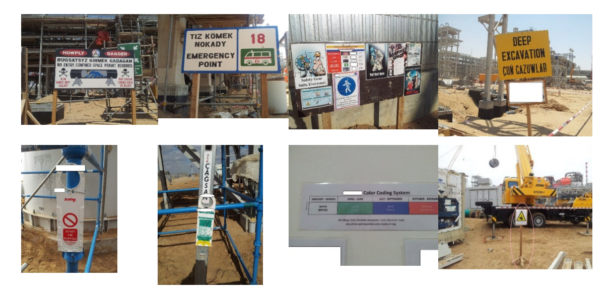
Figure 5: Some Visual HSE Practices on Site

The main contractor's and consequently the subcontractor's strongest emphasis were on health and safety (HSE) issues. The main contractor had strictly imposed their general practices on the subcontractors. Static and mobile safety signs, visual reminders, a colour-coded equipment checking system (every month a colour would be picked to identify the safety checked equipment), scaffolding safety tags (a colour-coded tag that determines if a scaffolding is safe to use or not), wind roses against gas leakages, safety barriers, posters etc. were all over the construction site. See Figure 5. Poka-Yoke systems incorporated into the cranes that lock the crane booms under certain environmental temperatures and above certain wind speeds were also in use.