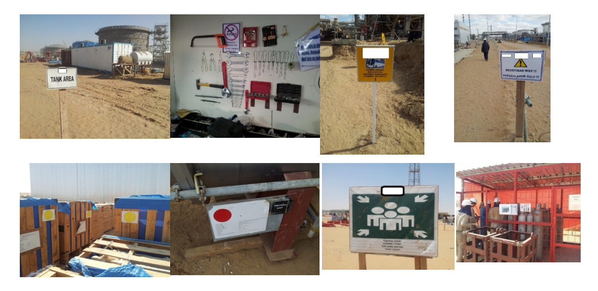
Figure 1: Standardisation of Workplace Elements: Example Applications