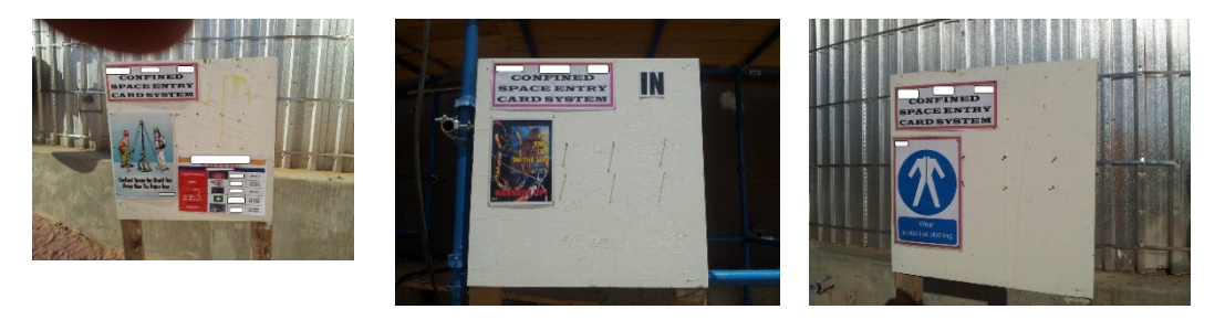
Figure 6: The Confined Space Tracking Boards

The subcontractor had adopted some boards to track the personnel working in confined spaces, particularly in tanks and manholes. The hazardous inert gases generated by welding and some installation activities in confined spaces are fatal. Therefore, human presence under those conditions is often constrained. The personnel intending to work in a confined space would hang its ID card on a board near the confined space and their entrance to the work area would be recorded. At a glance, who has been working since when in a tank or another confined space could be identified from the board. See Figure 6.