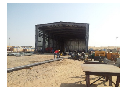
Figure 2: Pipe Spool Prefabrication Workshop

Neither systematic visual pull-control nor visual levelling efforts were found on the site and within the studied subcontractor. The manager and site supervisor had not heard of the kanban or heijunka system. One visual pull-control and production levelling opportunity was identified at the pipe-spool fabrication unit of the studied subcontractor. For a quick and high-quality erection, heavy pipe-spools (straight pipe sections, elbows, reductions, valves etc.) with different pipe/fitting diameters and configurations had been pre-fabricated (assembled together) mostly through welding operations. The prefabrication was managed and prioritised in a linear manner by the CPM based schedule of the piping works. This pipe prefabrication practice is not very different in essence from producing on-site concrete batches in which visual production levelling through kanban and heijunka has been successfully implemented in various building construction projects in Brazil (Tezel et al., 2010). Using the kanban and heijunka systems in such a setting for pipe-spool prefabrication remains as a noted VM research opportunity; yet the implementation requires a sufficient level of awareness from the management. See Figure 2.