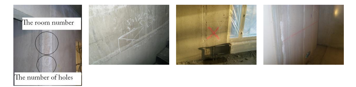
Figure 3: Improvisational and Traditional VM on Case 1

the people. However, these were all unsystematic efforts, developing within a group of people or occurring intuitively. See Figure 3.