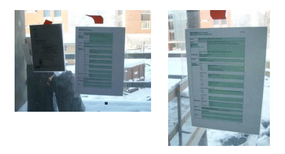
Figure 8: The Change Order List in a Room on Case 3

The management had also provided people with a list of the change orders for every room in each flat and posted those lists on the windows of every room, so the workers could easily track the current changes/ change orders in a specific room. Without knowing the Visual Management concept, the site management had found a good Visual Management solution for an important information need of the workforce. See Figure 8.