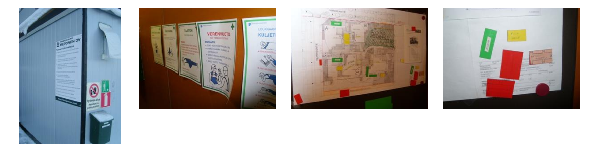
Figure 4: Information located in/around the Management's Trailer on Case 1

There were some occupational law, waste disposal (recycling) and health and safety related posters and visual information displays in the management's trailer. However, the location of that information was far from the production area, where it was actually needed. Apart from the line of balance chart and some system-wide information displayed in the management's office, the management had devised a colour coded magnetic board, which enabled them to visualise and plan the site layout more easily. The magnetic board was located in the management's meeting room, again far from the production area or the site entrance, where it could be easily seen by the people working on the site or visitors. See Figure 4.