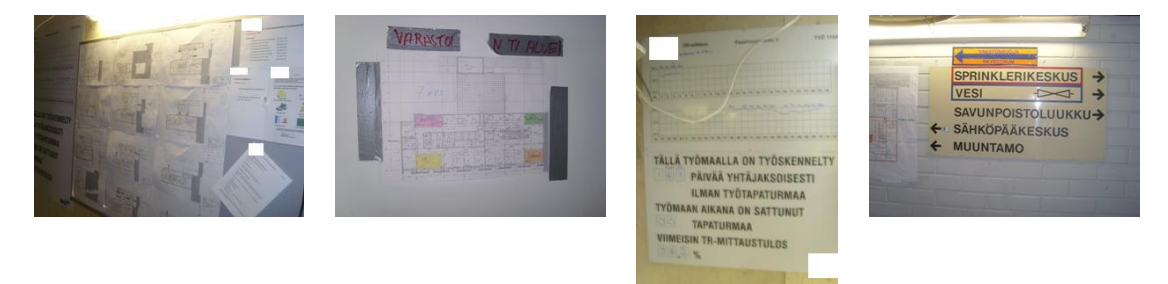
Figure 10: Case 4 was Comparatively Richer in terms of Integrated Information

The site manager was convinced about the effectiveness of managing people with visual clues/ aids. He had also systematically put colour coded floor stock plans, floor numbers and location identification, informative posters and projects on the walls, project performance metrics and general project information at the entrance in display on the site for everyone. He also indicated that the construction workers could learn to read the visually decorated plans/ projects (e.g. colour-coded material stock plans for floors) more easily and responded to them as desired. The site had a comparatively higher level of Visual Management adoptation and information display, thanks to the efforts by the site manager. See Figure 10.